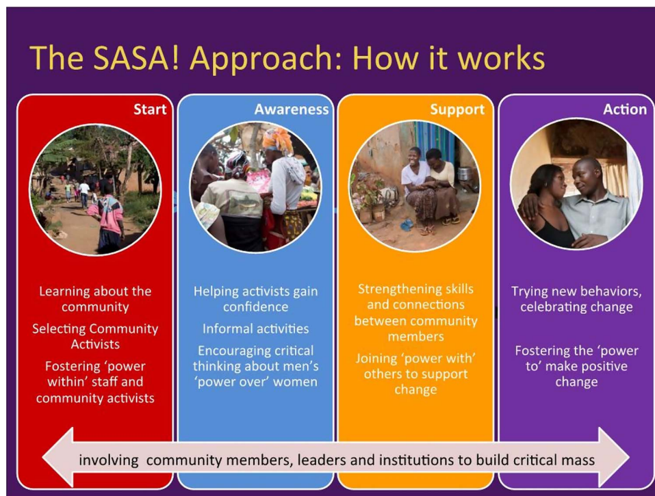
Figure 1 Four phases of SASA!